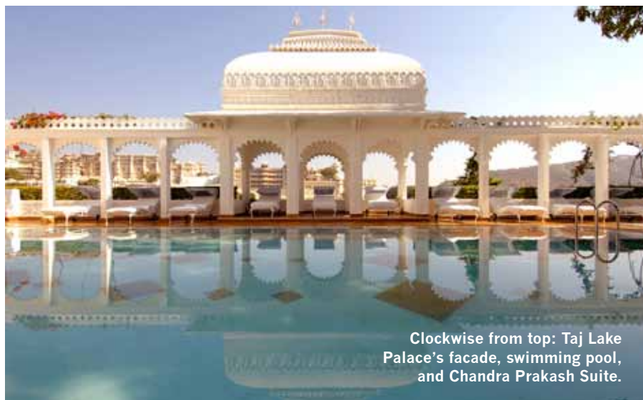
Clockwise from top: Taj Lake Palace's facade, swimming pool, and Chandra Prakash Suite.