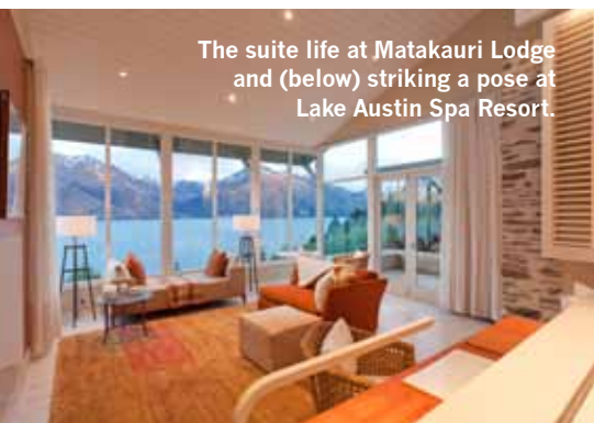
The suite life at Matakauri Lodge and (below) striking a pose at Lake Austin Spa Resort.

According to Maori legend, Wakatipu's recurring wave is caused by the heartbeat of a monster that slumbers below the water.