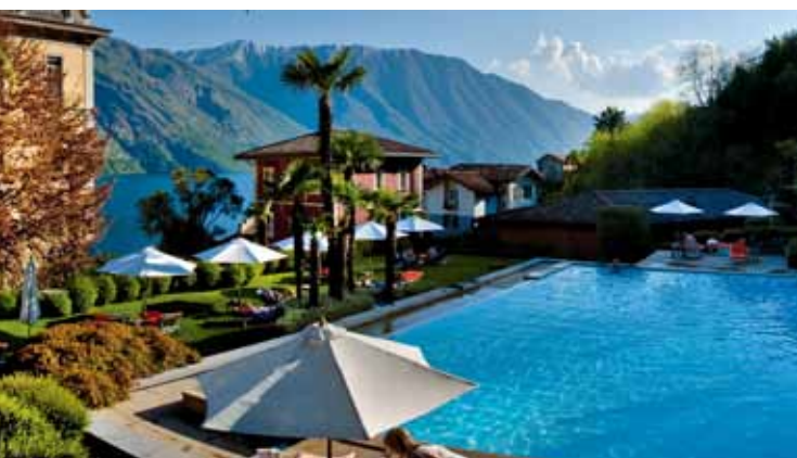
Italian idylls: Lakeside Lombardy and (left) Grand Hotel Tremezzo.