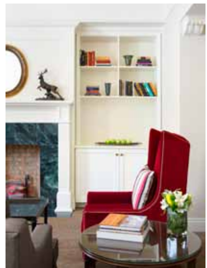
Clockwise from top: Horsing around, a One Bedroom Suite, and wild decor at The Fairmont.